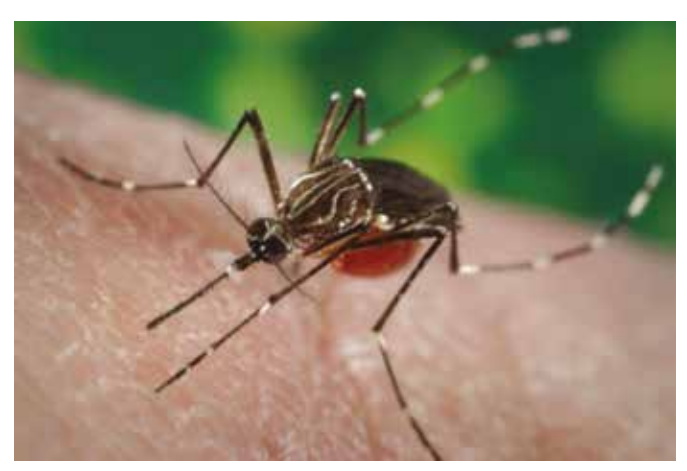
Fig. 1. Female yellow fever mosquito (Aedes aegypti).

Female mosquitoes need to take blood meals in order to produce eggs. The egg of the yellow fever mosquito is very small but still visible with the naked eye. Figure 4 shows its color, shape and size relative to the tip of a pencil. The eggs and immature stages of the yellow fever mosquito and Asian tiger mosquito develop in standing water, found mostly in artificial containers around the house, that can hold water for several days (e.g., cans, bottles, jars, buckets, tires, toys, furniture, flower vases, cisterns, bird baths and animal water troughs) [Fig. 5]. The yellow fever mosquito can also breed indoors (e.g., in flower vases), while the Asian tiger mosquito mainly breeds in natural and artificial water receptacles outdoors. The encephalitis mosquito breeds in standing water outdoors in pastures, ditches [Fig. 6], and irrigated croplands. Mosquitoes can complete their development from eggs to larvae or wrigglers [Fig. 7], pupae or tumblers, then adult mosquitoes within two weeks during the summer months.