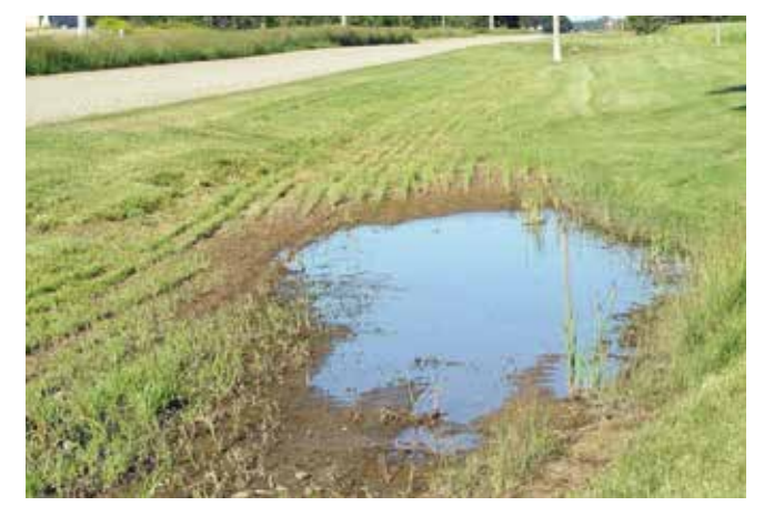
Fig. 6. Potential breeding site of the encephalitis mosquito ( Culex tarsalis ).