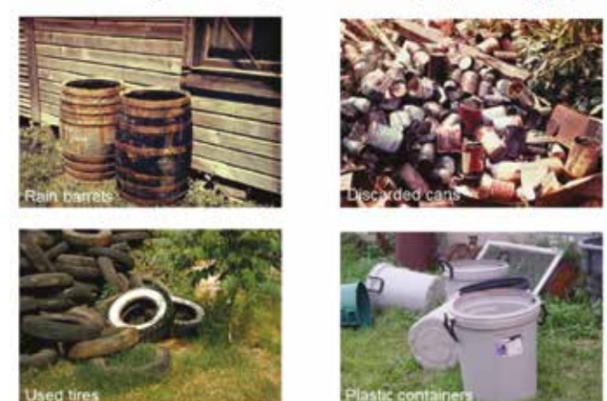
Fig. 5. Potential breeding sites of the yellow fever mosquito ( Aedes aegypti ).

Potential breeding sites for the yellow fever mosquito (Aedes aegypti)