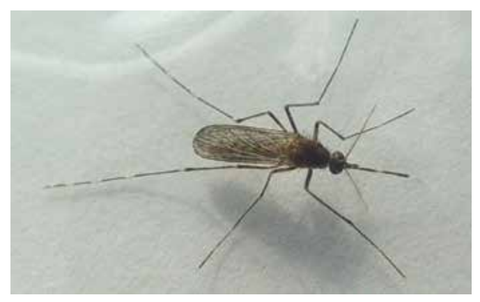
Fig. 3. Female encephalitis mosquito ( Culex tarsalis ).