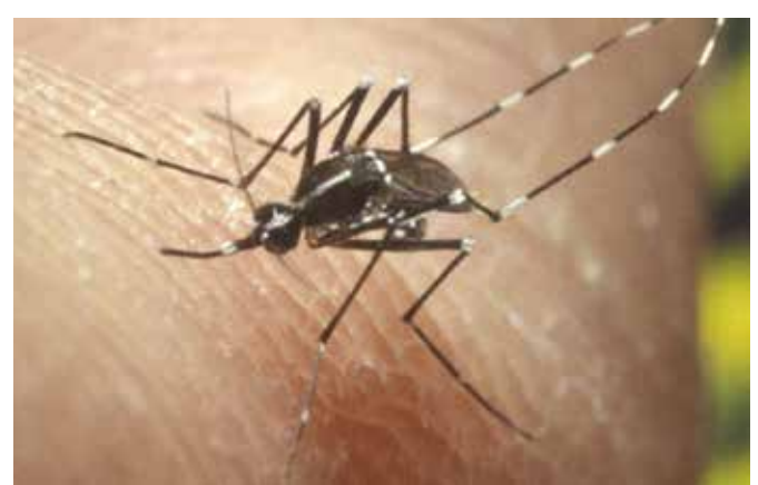
Fig. 2. Female Asian tiger mosquito ( Aedes albopictus ).