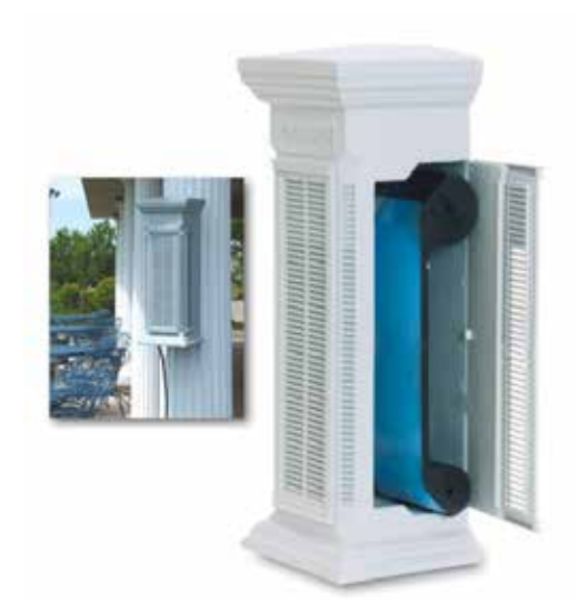
Fig. 9. Example of a mosquito light trap (Paraclipse Mosquito Eliminator)

Mosquito light traps that run continuously in outdoor areas can divert large numbers of blood-seeking mosquitoes away from human hosts. Mosquito light traps use "BL" bulbs that emit both ultraviolet and visible lights that are highly attractive to mosquitoes and other insects. Light traps and personal mosquito repellents may be more effective when used together as "push-pull" control tactics than when used on their own. That is, mosquitoes repelled by personal repellents worn by humans during outdoor activities may be diverted or attracted more to the light trap. An example of an effective mosquito light trap is shown in [Fig. 9] .